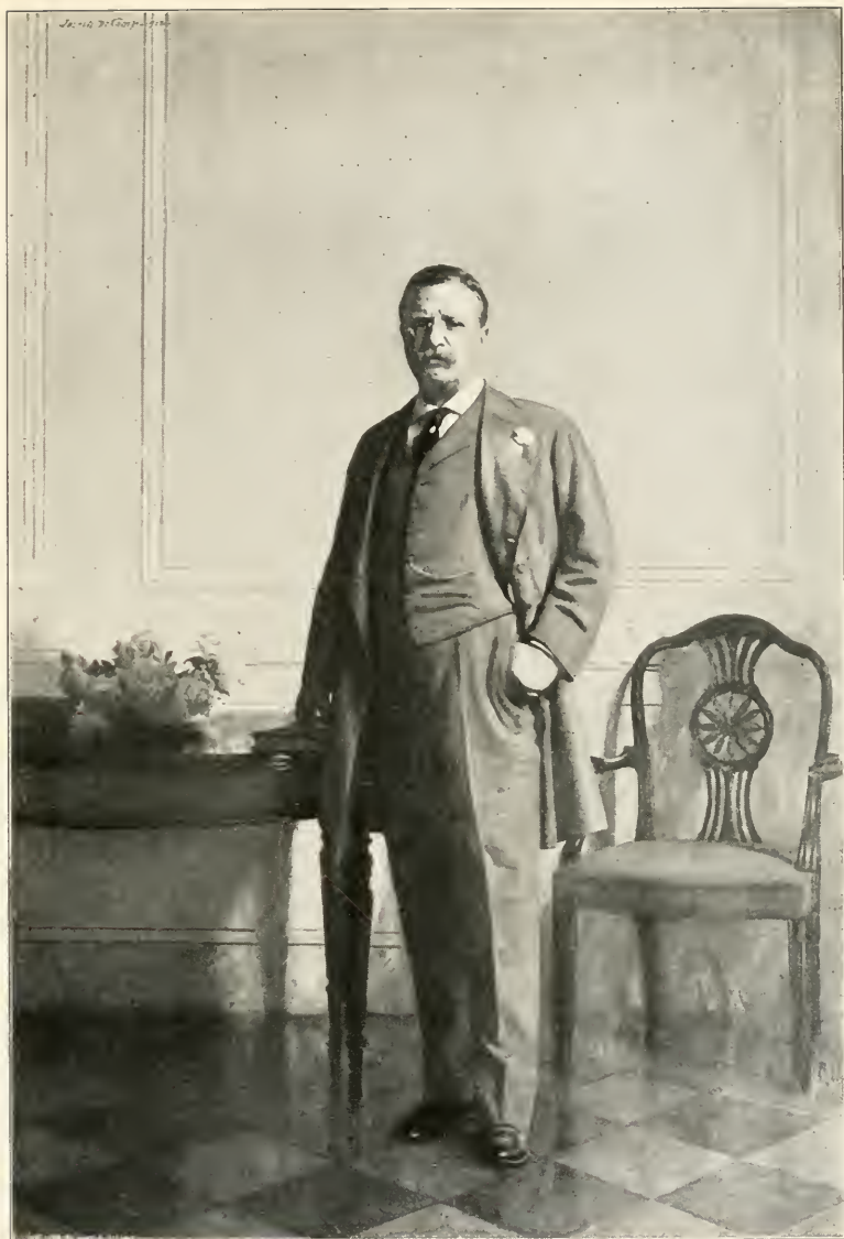
THEODORE ROOSEVELT, 1908

From a painting by Joseph De Camp presented to Harvard University by the Class of 1880, and now in Memorial Hall